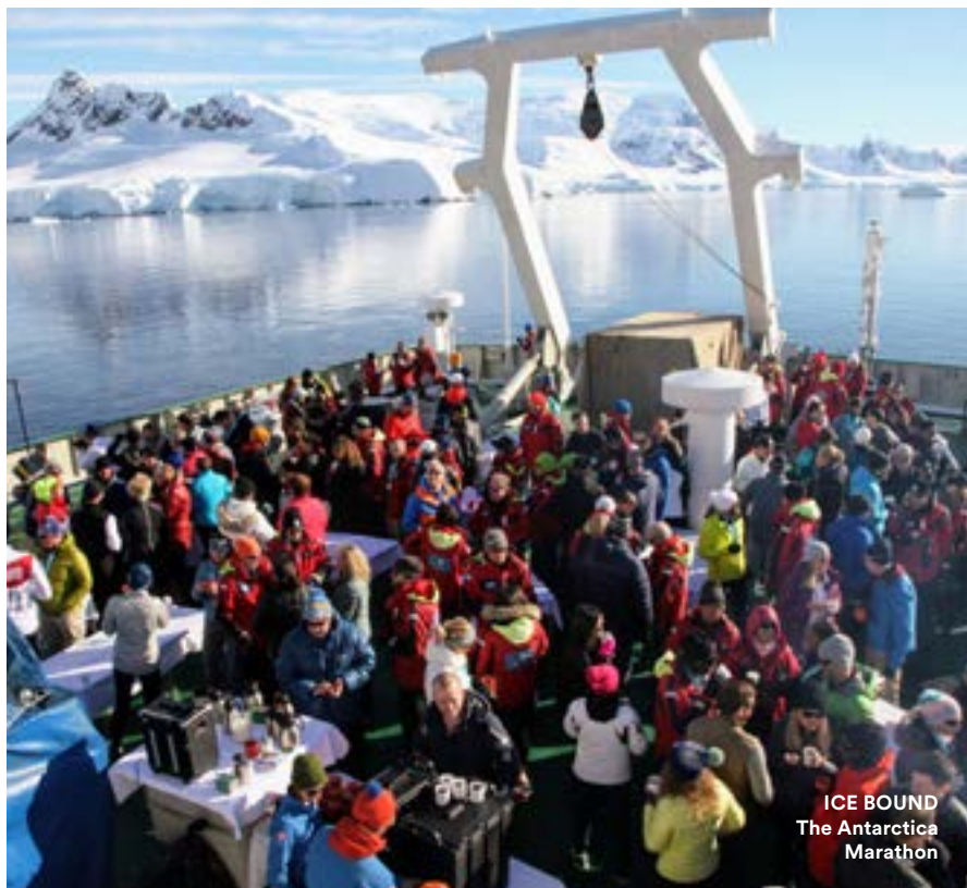
ICE BOUND The Antarctica Marathon